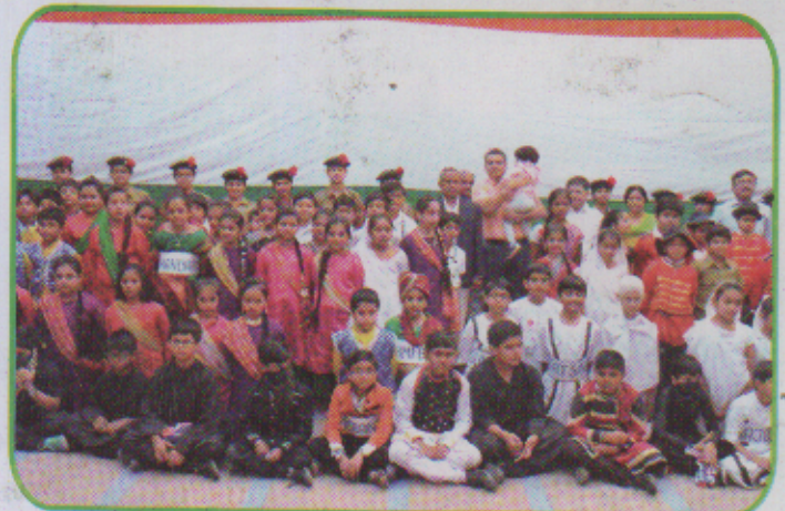
Musical Show participants with guests