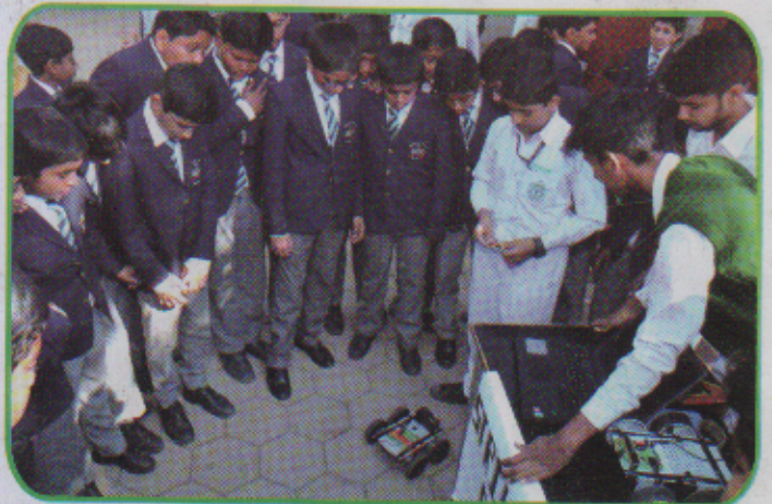
Robotics project being shown to RKC students