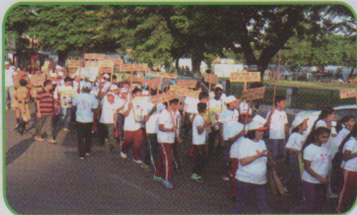
The rally in motion