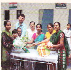
Joy of Giving

✍️ Happiness lies in giving and sharing. 'Joy of Giving Week' was organized by Community Service Club (CSC) of the school from 4th to 8th August 2014. The students and staff were requested by the CSC to bring useful things like food grains, oil, clothes, toys which received overwhelming response. The food grains were distributed to the needy among the support staff of the school on 13th August 2014.