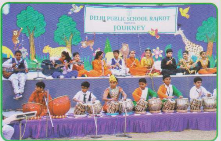
Journey - Classes 6 to 12